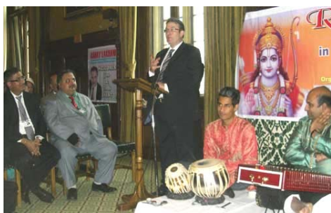
Tony McNulty MP addressing the gathering