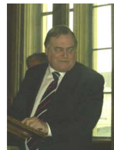
Mr John Prescott MP